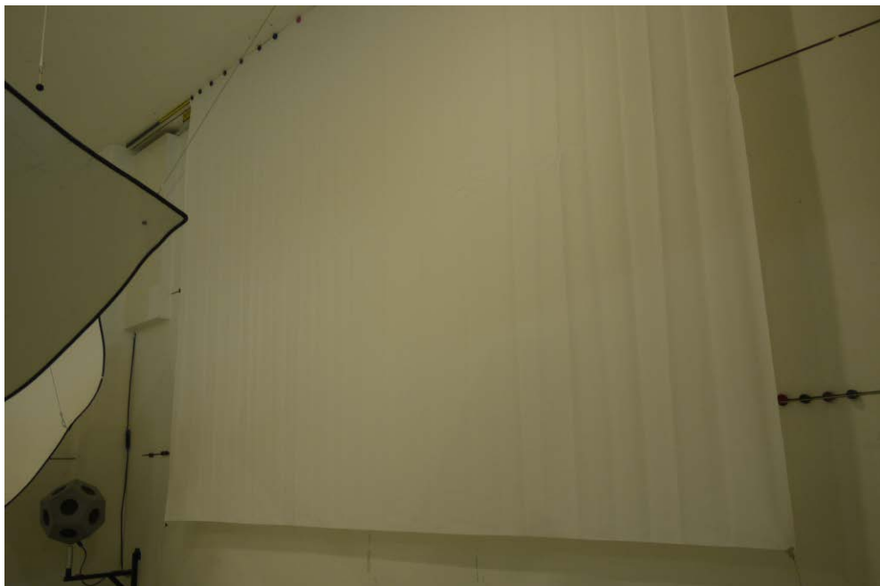
Figure B.2. Test object mounted in the reverberation room.