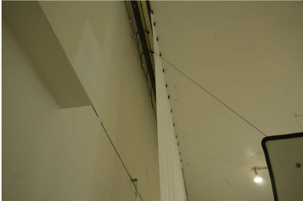
Figure B.1. Curtain fabric suspended on a metal rail.